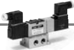
Non plug-in type